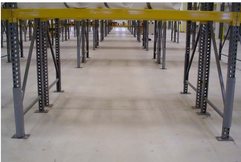
Fig. 4. Workplace safety: white concrete floors work well in industrial settings, too. The light color reduces shadows and improves lighting efficiency in large buildings, such as warehouses.

Advancements in surface treatments and admixtures have simplified the casting of architectural concrete and expanded possibilities. Finishes that expose the matrix of the concrete by polishing, acid etching, chemically retarding, and sandblasting are becoming more common. In precast applications, white cement is sometimes used exclusively in the exposed layer, producing a decorative facing mix that is just a few inches thick.