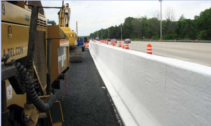
Fig. 5. Road safety: white traffic barrier sections are bright and highly visible to drivers.