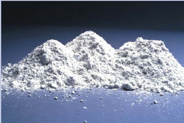
Fig. 1. White cement is subject to exacting quality control procedures that minimize color variation during manufacturing. This provides a neutral base for concrete finishes whether they are white or tinted.

All white cements manufactured in North America are made to strict standards to meet customer needs. Color is an especially important quality control issue in the white cement industry, where consistency in brightness and tone are principal concerns. The color of white cement depends on both the raw materials and the manufacturing process. Metal oxides (iron, manganese, and others) that are present in the finished material influence its whiteness and undertone, making it imperative to use carefully selected raw materials (See Figure 1).