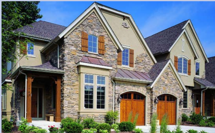
Fig. 6. Fire safety: the façade of this residence combines two noncombustible finishes, portland cement plaster (stucco) and manufactured stone veneer products, for an attractive appearance. These products are frequently made with white cement.