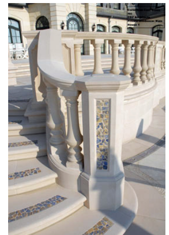
Fig. 8. The fine texture, intricate detail, and excellent color consistency are hallmarks of Cast Stone.

With coast to coast distribution centers in the U.S. and Canada, white cement is a readily available concrete ingredient that works well in many applications. It offers aesthetic and performance benefits to pavements, buildings, and other structures. For more information on white cement and its use in structural, architectural, and decorative applications, please visit the PCA website www.cement.org and look for Architectural & Decorative Concrete in the Concrete Technology area under Materials & Applications.