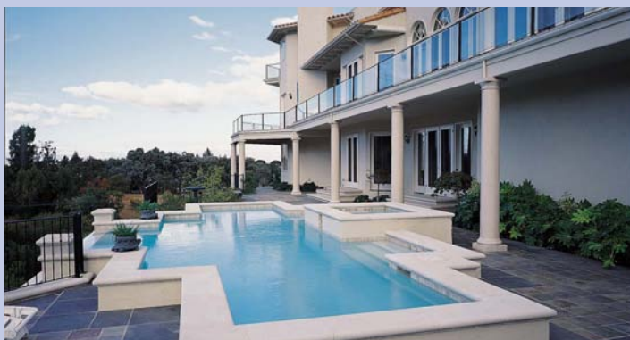
Fig. 7. Pool safety: White or light-colored surfaces offer the most safety for high visibility in pools. Plaster finishes for swimming pools provide long life and low maintenance.

For transportation projects, white or colored concrete creates a strong visual contrast and offers an opportunity for passive traffic safety. Median (“Jersey”) barriers made of white concrete not only physically separate vehicles from hazards, but are highly visible, even at night and in wet conditions. These barriers are made either as cast-in-place or precast concrete elements. Light colored elements in roadways provide a traffic calming effect that increases safety for all modes of transportation (see Figure 5).