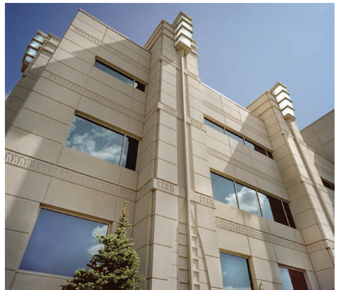
Fig. 2. White cement produces dynamic concrete.

Cement of the same type and brand from the same mill should be used throughout the entire job to minimize color variation. When possible, adequate quantities of all materials – cements, supplementary cementing materials, and aggregates – should be stockpiled to ensure a single source and uniform color. Mockups constructed at the project site serve as reference panels for comparison. If a change in source materials is needed, additional test panels should be fabricated.